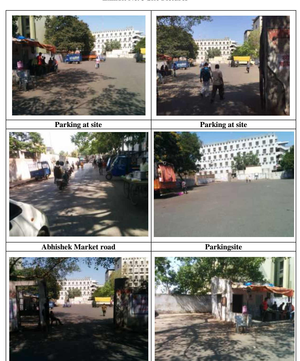
Exhibit No. 3 Site Pictures